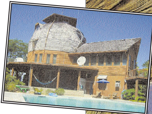
HOME FROM HOME: Andy Hunt, right, getting to grips a vine snake, runs the Belize Jungle Dome adventure centre.

THE jungle drums were today beating to one simple message: 'You can survive!'